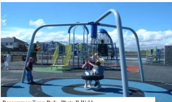
Roscommon Town Park.

We are collecting photos and information of playgrounds in Ireland many of which will be displayed on our website. The information will be incorporated into the data base of playgrounds compiled as part of the National Audit of playgrounds