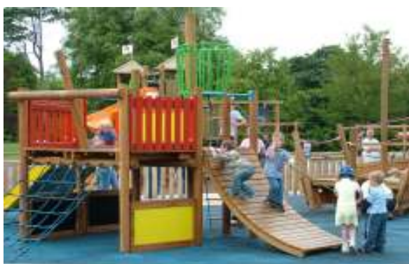
People's Park Waterford City